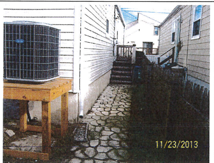
Left Side View – Date of Photograph: (See Photo Stamp)