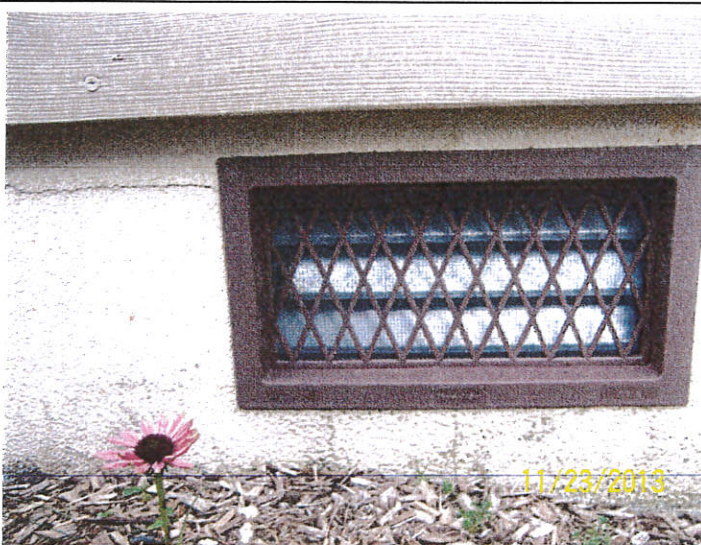
Vent View – Date of Photograph: (See Photo Stamp)