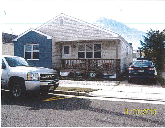
Front View – Date of Photograph: (See Photo Stamp)

If using the Elevation Certificate to obtain NFIP flood insurance, affix at least two building photographs below according to the instructions for Item A6. Identify all photographs with: date taken; "Front View" and "Rear View"; and, if required, "Right Side View" and "Left Side View." If submitting more photographs than will fit on this page, use the Continuation Page on the reverse.