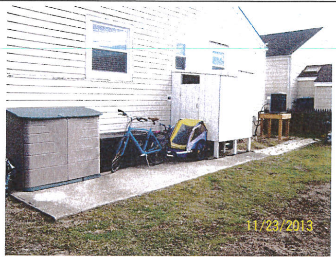
Rear View – Date of Photograph: (See Photo Stamp)